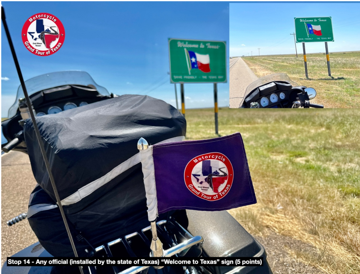
Stop 14 - Any official (installed by the state of Texas) “Welcome to Texas” sign (5 points)

Any official “Welcome to Texas” sign (i.e. Owned and installed by the state gov’t.)