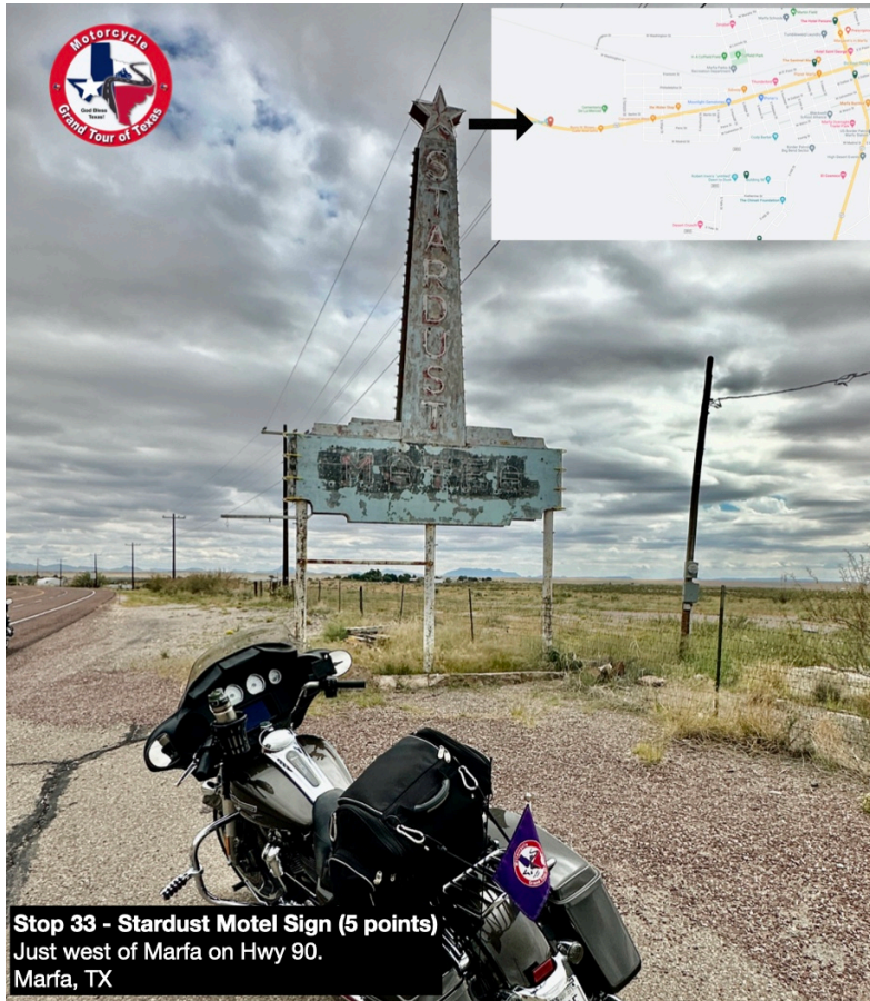
Stop 33 - Stardust Motel Sign (5 points) Just west of Marfa on Hwy 90. Marfa, TX